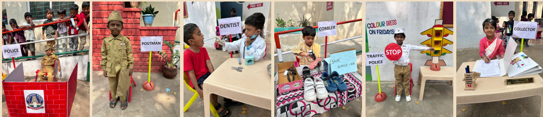
Celebrating the everyday heroes in our community — our kindergarten stars shining as community helpers!