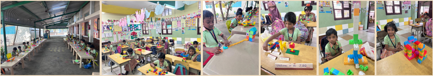
Our Kindergarten stars built a world of creativity at the Building Blocks Competition! From colorful towers to dream houses, robots to drones, every creation showcased their brilliance as little architects.