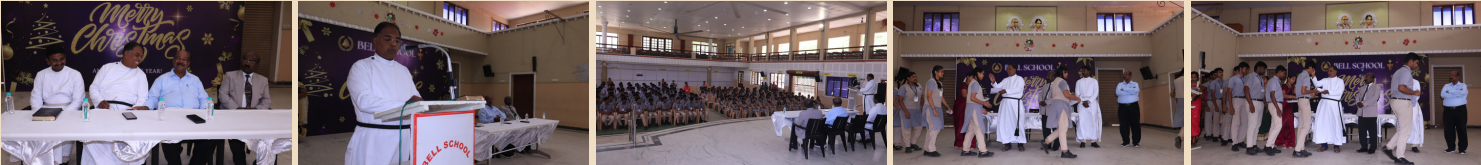
Our school conducted a special prayer meeting for students appearing for the public examination. The prayer was held to seek blessings and guidance for their success.