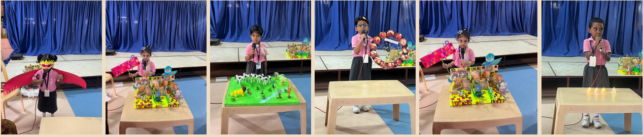
Our young narrators led us on enchanting journeys with their assured voices and imaginative expressions during the story telling session.